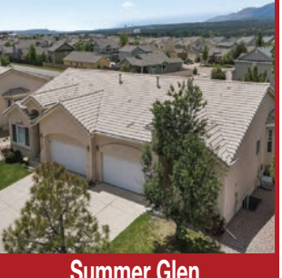
Summer Glen COLORADO SPRINGS, CO 80921