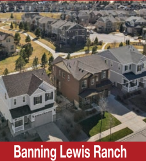
COLORADO SPRINGS, CO 80927