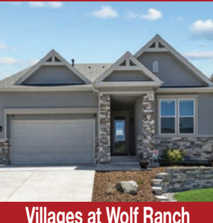
Villages at Wolf Ranch COLORADO SPRINGS, CO 80924